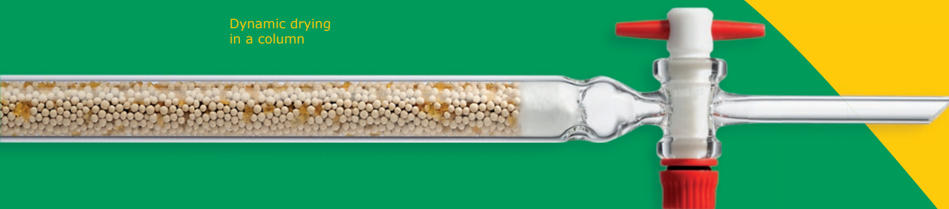
Dynamic drying in a column

The drying process can be optimized by using a drying agent of small particle size. This significantly increases the reaction surface, hence column length and packing material can be decreased. However, this method typically reduces flow rates, since smaller particle sizes increase flow resistance in the column.