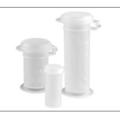
Capitol Vial Snappies™ Breast Milk Container System