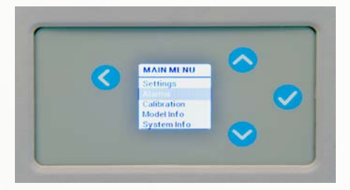
Clear intuitive displays for precise temperature control