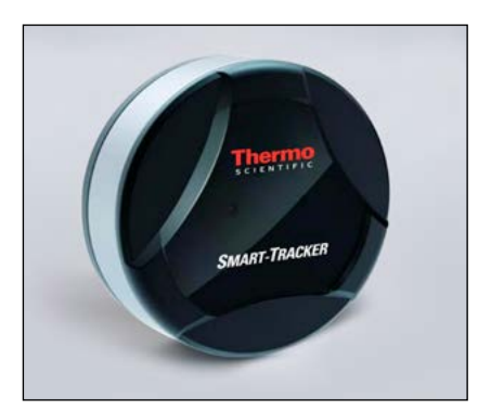
Smart Tracker wireless monitoring device