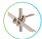
Extension Clamp 3-Prong Swivel Clamp Hook Connector