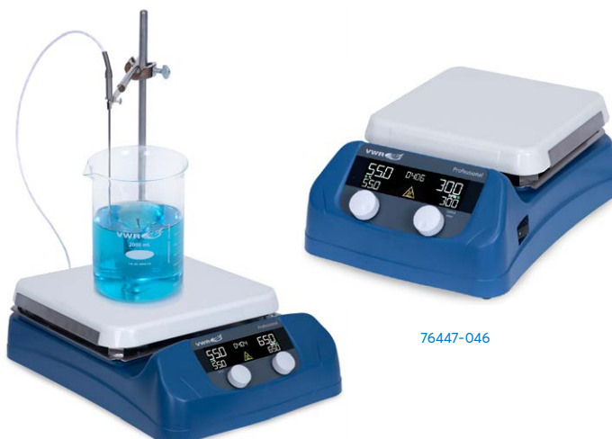
76447-026 with optional 11301-110 support rod kit