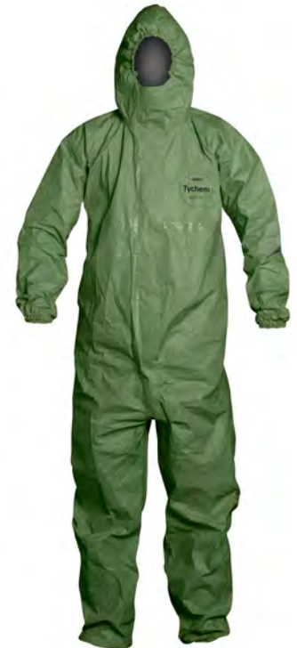
Tychem® 2000 SFR

Tychem® 2000 SFR garments provide chemical and secondary flame protection in a lightweight garment. Tychem® 2000 SFR garments are intended to be worn over primary flame resistant garments, like DuPont™ Nomex®.