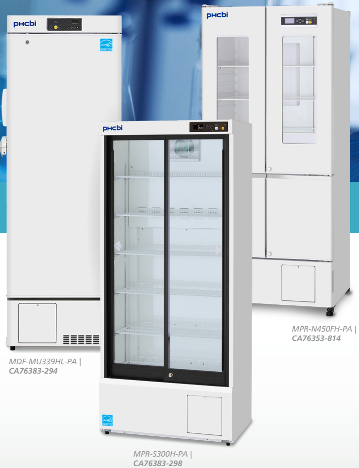
MDF-MU339HL-PA | CA76383-294