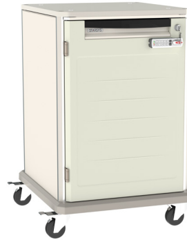
Starsys Under Counter Cart with Door

Starsys carts are design to be durable. All preconfigured Under Counter carts come with High Density Polyethylene (HDPE) tops, black door / drawer pulls, and 3 inch casters.