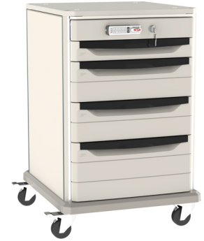
Starsys Under Counter Cart with Drawers