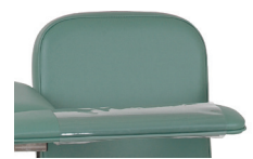
Clear Arm Wrap