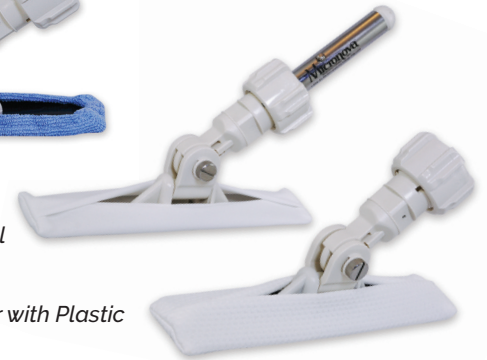
PolySorb™ Cover with Plastic Isolator Tool