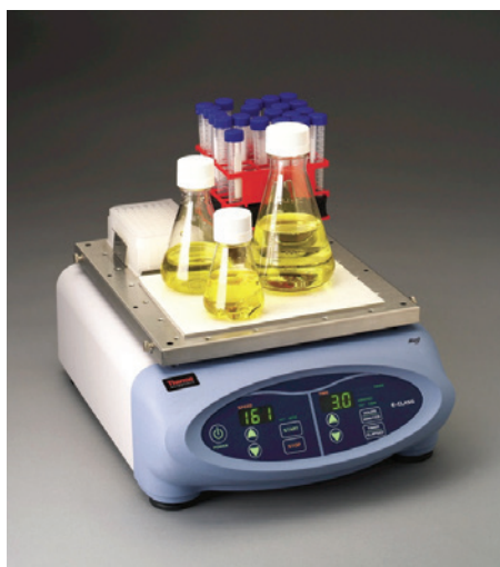
Figure 1: The Thermo Scientific Non-slip Adhesive Mat is flexible, convenient and easy to use for attaching a wide variety of vessels to an orbital shaker. The Adhesive Mat holds large volumes securely, with an upper limit of 2 L volume in a 4 L flask at a speed of 250 RPM.

When Thermo Scientific Adhesive Mats are properly used, kept clean, and used with the specified volumes and speeds, they provide a flexible, convenient and easy to use alternative for attaching a variety of vessels to any orbital shaker.