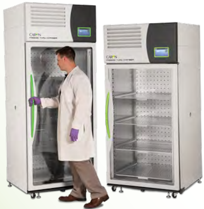
33 ft 3 Large capacity, small footprint 25 ft 3 Rolls through a standard doorway

Common applications for these chambers include: freeze/thaw studies, pharmaceutical drug studies, concrete and asphalt testing, coating and adhesive testing, outdoor weathering tests, stress testing and more! Not only are these Freeze/Thaw Chambers consistently reliable, but they also offer energy efficiency and best-in-class customer friendly features.