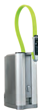
PURELAB flex 3&4