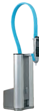
PURELAB flex 1