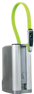
PURELAB flex 3&4