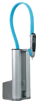
PURELAB flex 2