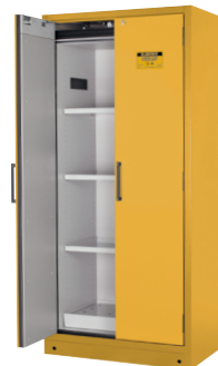
10803-744 with 10803-760