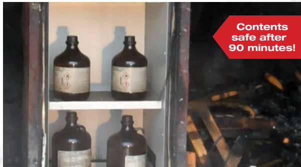
Contents remain intact after a 90-minute burn test.