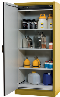
10803-740 with 10803-756