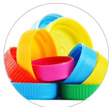
Plastics & Polymers