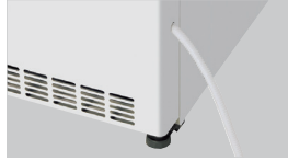
Model MDF-MU539HL-PA | 76383-296 shown with optional storage bins.

Occasional manual defrosting maintains the most efficient performance. An integrated condensate drain hose permits easy removal of water and stows out of the way when not in use.