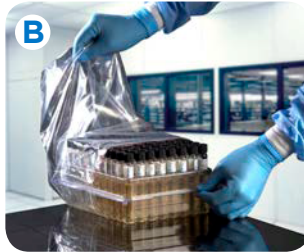
B Take into cleanroom, then remove plastic bag.