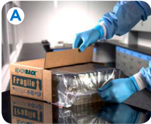
A Remove ReadyRack™ from box outside of cleanroom.