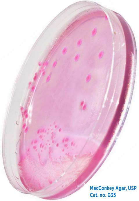
MacConkey Agar, USP Cat. no. G35