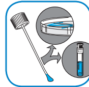
3. Cultivate specimen