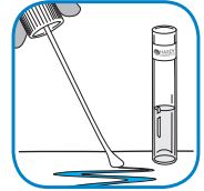
1. Collect sample