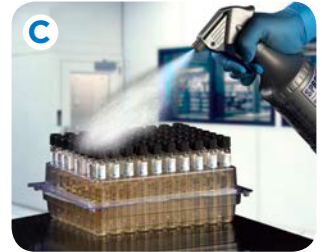
C Spray down entire ReadyRack™ with isopropyl alcohol.

Packaged in a controlled environment to reduce particulates