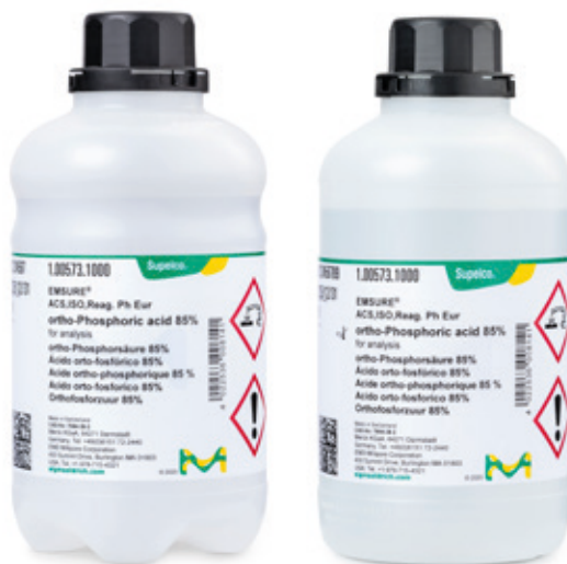
Previous 1 l HDPE bottle

Our new easy grip 1 l HDPE bottle is made of the same material as its predecessor. So the packaging material is still perfectly compatible with its chemical contents. Also, the new bottle has exactly the same height and diameter, so you won't need to adapt your safety cabinets or shelves.