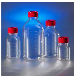
Costar traditional style storage bottles