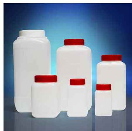
Gosselin™ square HDPE storage bottles