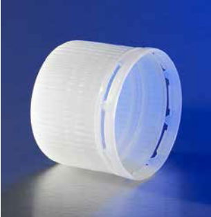
Tamper-evident screw cap