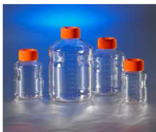
Corning low profile easy grip style storage bottles