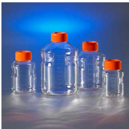
Corning easy grip round PS storage bottles