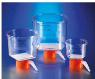
Bottle top vacuum filters