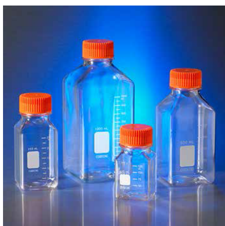
Corning square PET storage bottles

* Bottle performance in freezers depends on both the temperature and contents in the bottle. It is strongly recommended that a trial run be performed under actual conditions to test the suitability of the bottles for frozen storage.