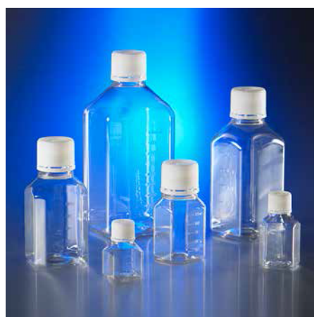
Corning octagonal PET storage bottles