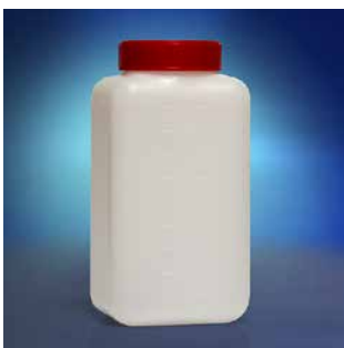
Square bottle 1L HDPE