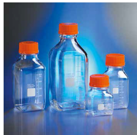
Corning square PC storage bottles