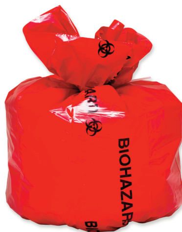
Roll of red biohazard bags with plastic core

The Micronova Biohazard and Hazard Bags are constructed from FDA compliant, low density polyethylene. The red and yellow biohazard bags are designed for containment and disposal of biomedical waste with the biohazard symbol and warning message displayed on each biohazard bag. A yellow hazardous material bag is designed for segregation and disposal of other hazardous waste, in areas where red bags are designated biohazard.. Biohazard and Hazard Bags can be used with the BLSSH series of Micronova BinLiner™ stands. Liners gamma irradiated for aseptic areas.