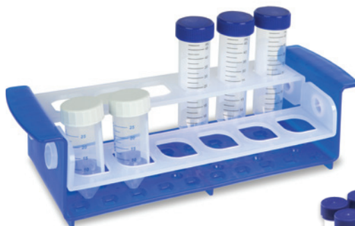
Ergonomic handles for ease of transporting the rack