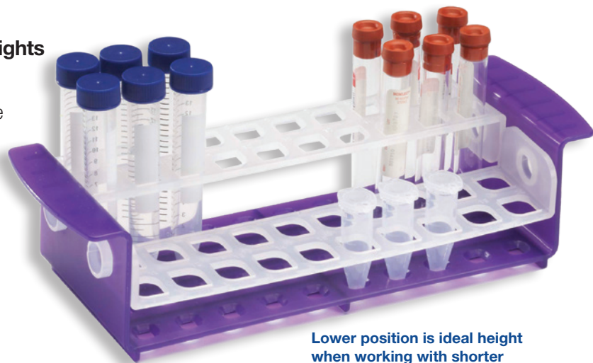
Lower position is ideal height when working with shorter microcentrifuge tubes