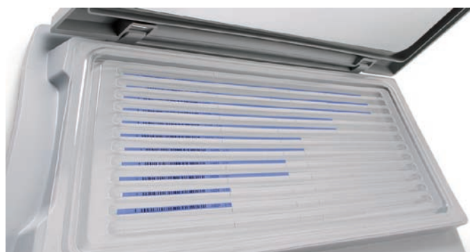
Fig 2. Reswell Tray containing rehydrated strips with variable lengths.