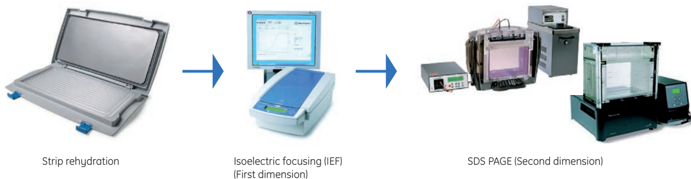
Fig 3. 2-D electrophoresis workflow.