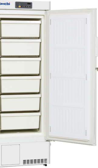
Model MDF-MU339HL-PA | 76383-294 shown with optional storage bins.

Stored Product Protection The single door Biomedical ECO freezer creates stable temperature storage in a space-saving cabinet.