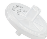
Minisart® NY 25 mm