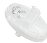
Minisart® RC 25 mm