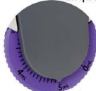
ali-Q 2 & ali-Q 2 VS