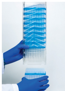
Step 1: Remove the base