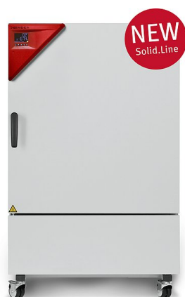
Model KBF-S 240