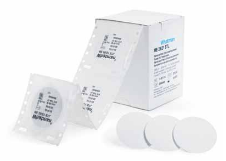
Fig 1. Improved STL membranes for microbiological quality control

The liquid was filtered through a membrane and the microorganisms were collected on the membrane surface. The filter was incubated on a nutrient medium and individual colonies were then evaluated. This method is suitable for large sample volumes and low microorganism counts.