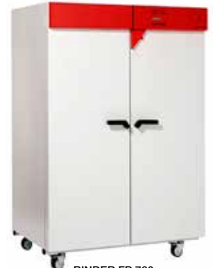
BINDER FP 720 25.4 cubic ft