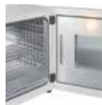
Door with heated viewing window and interior lighting