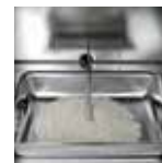
Sample temperature sensor