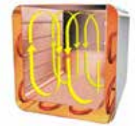
Classic Air Flow