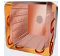
Classic Forced Convection