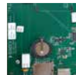
Real time clock