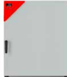
BINDER FD 260 9 cubic ft