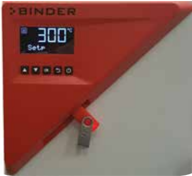
Controller Avantgarde.Line shown with 4 GB USB stick