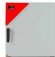
BINDER ED 56 2 cubic ft