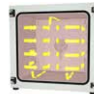
Avantgarde Air Flow