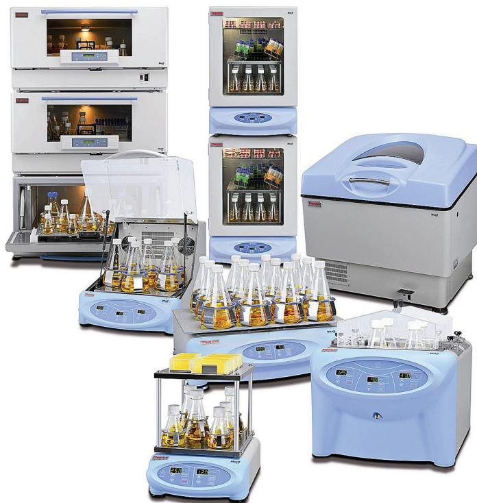
Figure 1. Orbital shakers are available in a wide variety of sizes and formats.

Regardless of the models used, this application note contains valuable information which applies to all orbital shakers. We offer helpful tips to properly install your shaker, guidelines for best operation, proper usage and cleaning, and a general