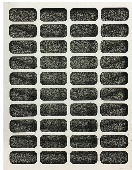
Figure 5. A typical air filter and cover for a refrigerated shaker.

filter. This may be required more frequently depending on the usage of the unit and surrounding ambient conditions.