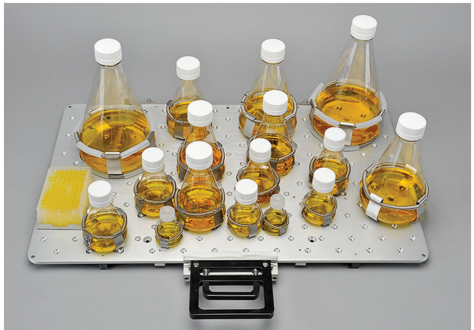
Figure 2. Removable platforms are recommended for all orbital shakers for greater flexibility and to facilitate regular cleaning and disinfection. A universal platform will accept a wide variety of clamps.

Before installing flask clamps, check whether a flexible spring must first be installed. If your clamps require a spring, it must be used, because without it the flask will not be secured