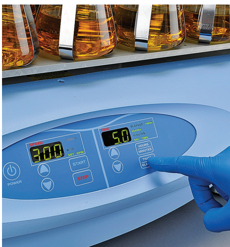
Figure 3. A shaker should offer a clear display which allows viewing of all parameters simultaneously and allows individual, precise control.

If you are connecting a data monitoring and remote alarm module, now is a good time to set that up. This is also time to become familiar with the different alarms indicated by the shaker and how to correct them. If your shaker allows, you can change the alarm setpoints and triggers—such as high and low temperature