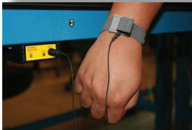
Figure 1 – Anti-static wrist straps drain charges from workers into a grounded system.

While lab technicians can be grounded through the use of a wrist strap, the garments they wear can defeat this strategy if they are made of insulative, synthetic materials. Therefore, garments made of natural materials will help with static control.