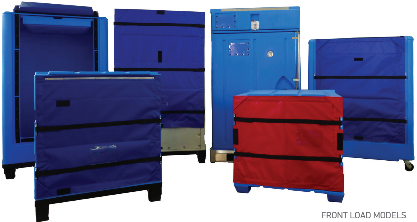
FRONT LOAD MODELS

ThermoSafe chests and containers are strong, durable, and specifically manufactured to be used and reused. Replacement latches, hinges, handles, and other handling and replacement accessories are available at a low cost. Contact your VWR Sales Representative for more information.