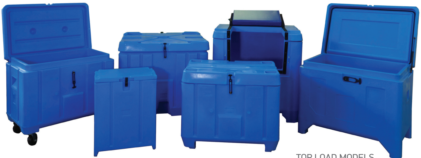
TOP LOAD MODELS

Ranging in various sizes and styles, these durable insulated containers make storing, transporting, and unloading efficient and worry-free. High impact polyethylene can handle the rigors of transport: the tight fitting lid and container construction, maintains temperatures, and maximizes shipping and transporting efficiency.