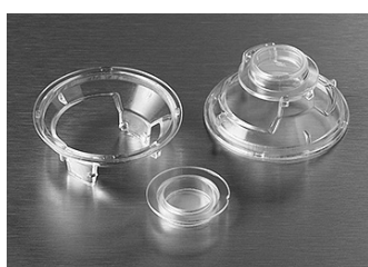
Polyester Snapwell inserts