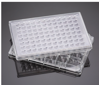
Falcon HTS insert plates