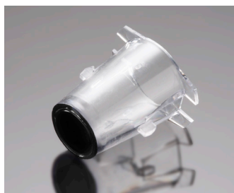
Corning FluoroBlok 6.5 mm insert