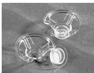
Polycarbonate Snapwell inserts