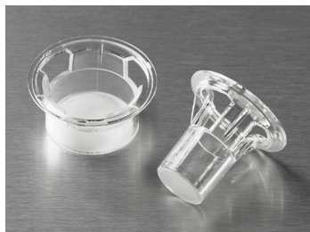
24 and 6.5 mm Transwell inserts