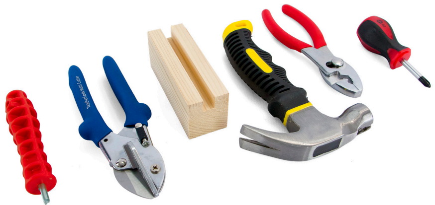
Maker Cart Included Tools: