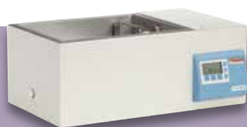
SWB 15S Water Bath