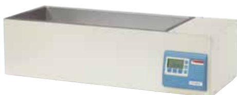
CIR 35 Water Bath