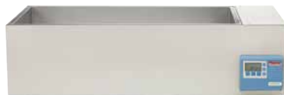
CIR 89 Water Bath