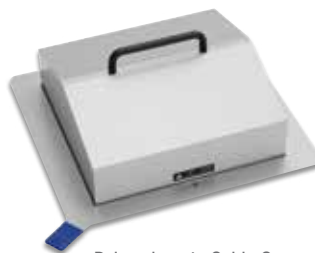
Polycarbonate Gable Cover