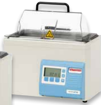
GP 05 Water Bath