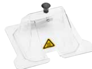
Polycarbonate Gable Cover