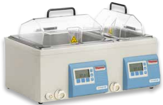
GP 15D Water Bath