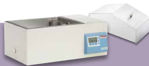
DUB 15 Water Bath