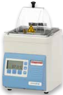
GP 02 Water Bath