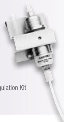
Water Regulation Kit