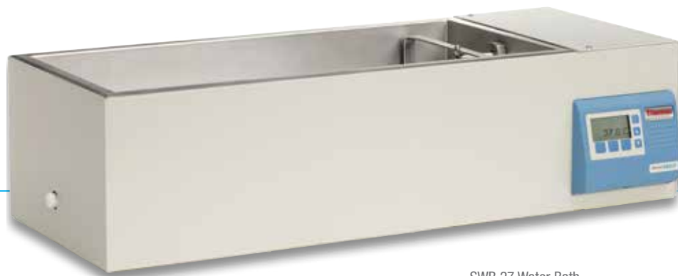
SWB 27 Water Bath