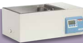
SWB 15 Water Bath