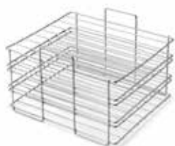
Stainless Steel Petri Dish Rack