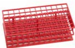
Nalgene Unwire Test Tube Full Rack