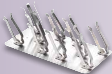
Test Tube Tray