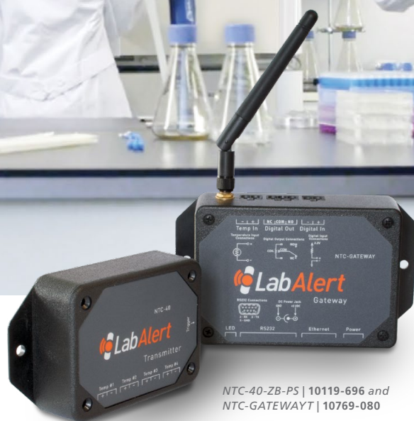
NTC-40-ZB-PS | 10119-696 and NTC-GATEWAYT | 10769-080