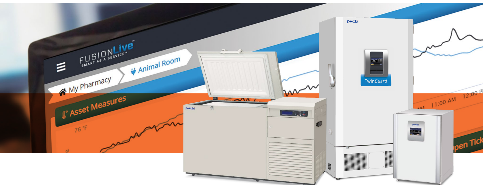
PHCbi ULT Freezers and Incubator shown with installed LabAlert Transmitters