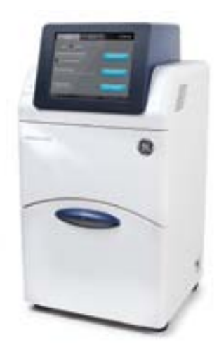
ImageQuant LAS 500

The ImageQuant LAS systems are flexible systems that cover a wide range of imaging applications. These CCD based imagers provide an affordable option for protein detection with genuine benefits, including quantitation with high sensitivity, publication grade data, and image and data archiving.