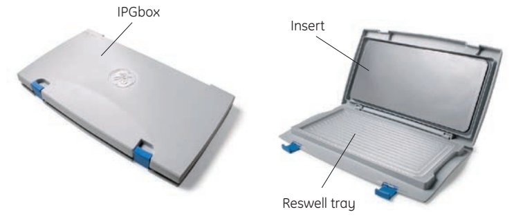
Fig 1. IPGbox is designed for rehydrating Immobiline DryStrip Gels.