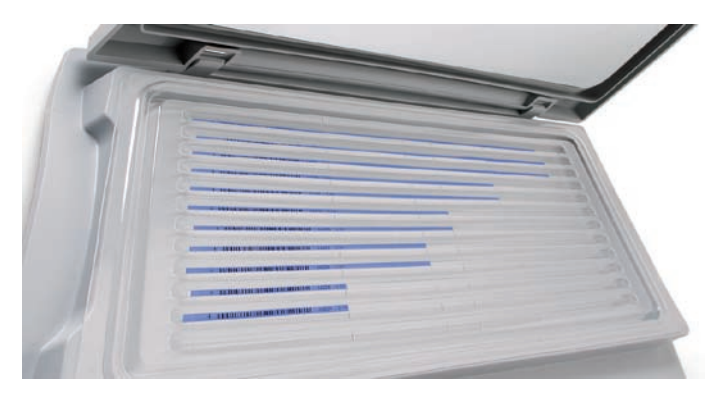
Fig 2. Reswell Tray containing rehydrated strips with variable lengths.

Fig 1. IPGbox is designed for rehydrating Immobiline DryStrip Gels.