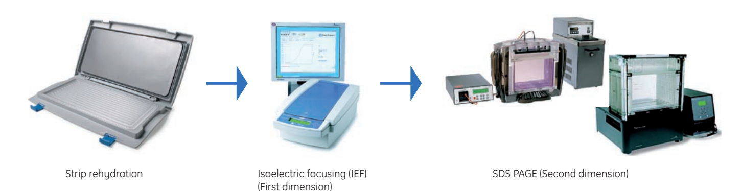
Fig 3. 2-D electrophoresis workflow.