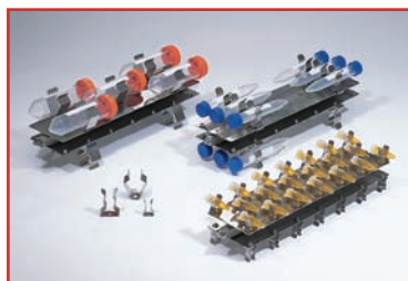
Multi-Tube Carousels for Little SHOT III

Models 230552 & 230332 - The Multi-Tube Carousels work with a variety of interchangeable clip sizes to hold a combination of 50 mL, 15 mL, 2.0 mL, and 1.5 mL tubes, allowing for simultaneous processing of multiple sized tubes. The clips are supplied with mounting hardware, and mount onto the plates on the carousel. Depending on the tube size, the tubes may be positioned horizontally, vertically, or at an angle.