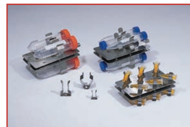
Multi-Tube Carousels for Bambino