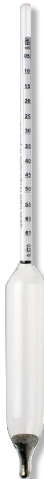
Specific Gravity Hydrometer