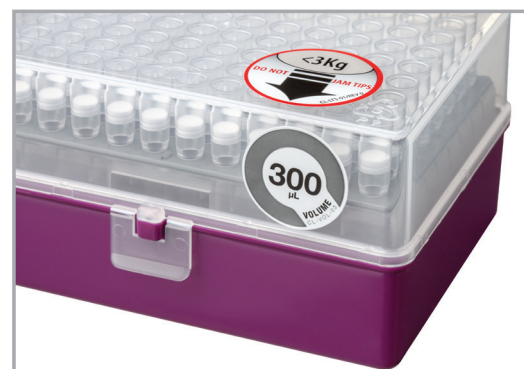
Sturdy autoclavable racks color coded with tip volume range