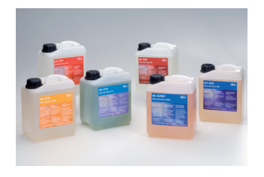
elma lab clean cleaning solutions Solutions for the laboratory see page 9