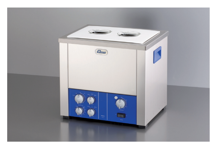
Elmasonic TI-H 10 with multi-frequency technology 25/45 kHz and cover with holes