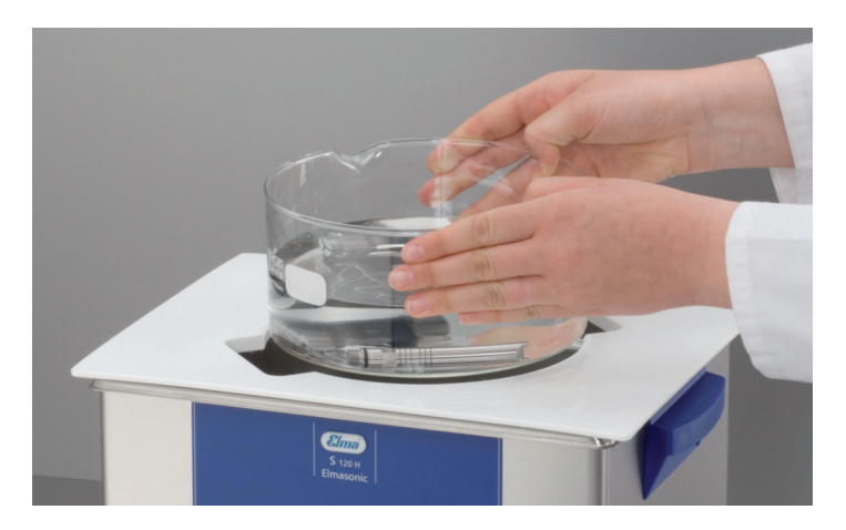
Cover with hole, made of PP

The right equipment for correct analyses