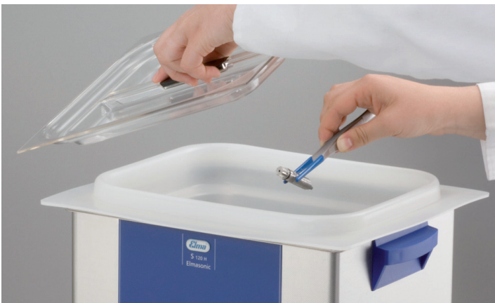
Elma plastic tub, made of PP