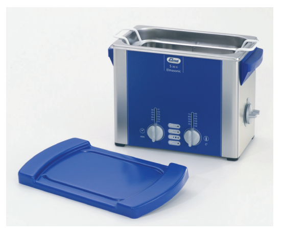
Elmasonic S 30 with basket and cover