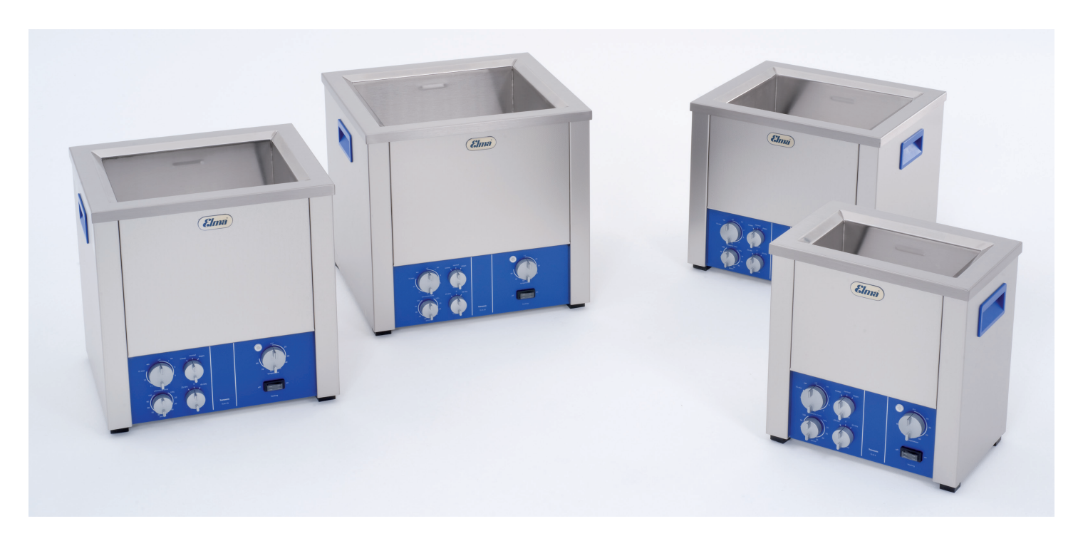
Elmasonic TI-H units with multi-frequency technology available in 4 different sizes

Specialised Elma units for the multiple requirements in terms of power, permanent operation or different frequencies in the industrial laboratory and for simulation purposes in the technical centre