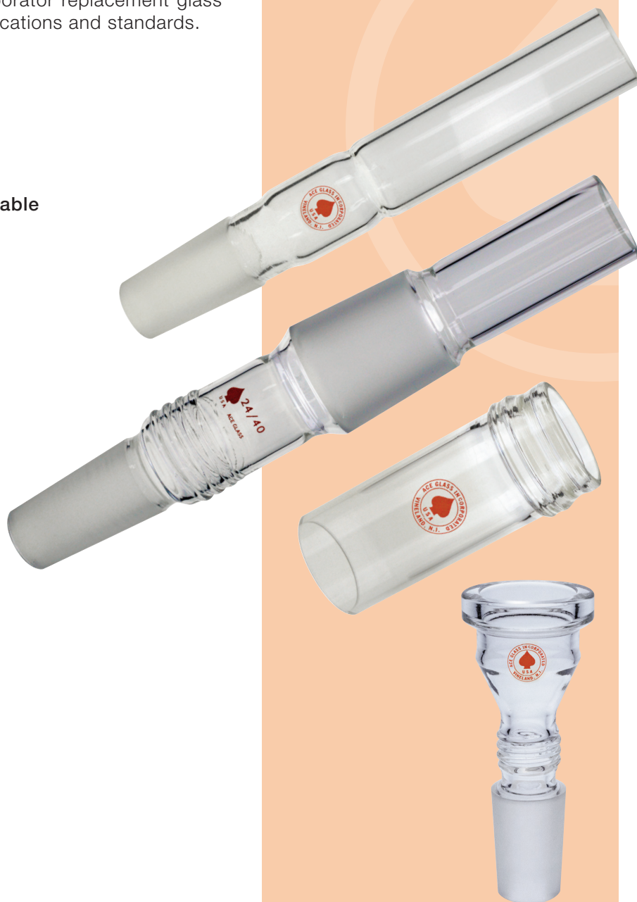
(From Top to Bottom) Plain Series, GL Series, Steam Pipe & Adapter Tube

Contact us for all your rotavap glassware replacement part needs, for both large and bench scale applications.