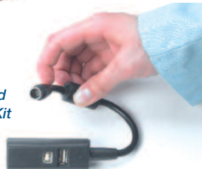
HQd Meter USB and AC Power Adapter Kit