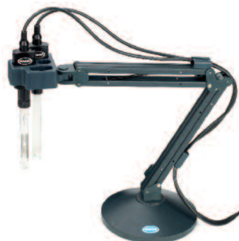
Universal Probe Stand for Standard IntelliCAL Probes

iButton® is a trademark of Maxim Integrated Products.