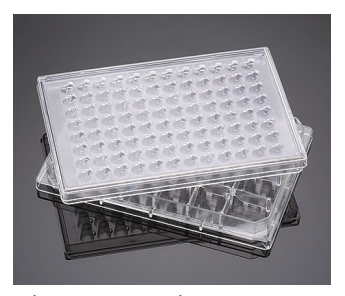
Falcon HTS insert plates

HTS insert plates are arrays of individual cell culture inserts connected by a rigid, robotics-friendly holder. This single-unit design makes insert plates ideal for running automated, high throughput drug transport (Caco-2 cells) cell toxicity studies or cell migration and invasion studies.