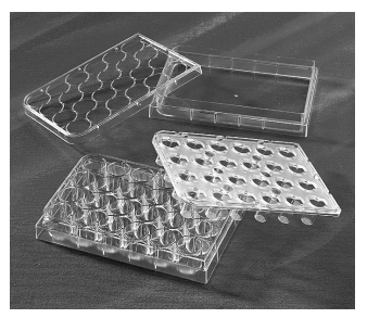
HTS Transwell insert plates