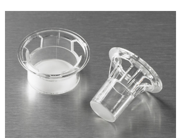
24 and 6.5 mm Transwell inserts