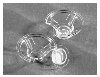
Polycarbonate Snapwell inserts