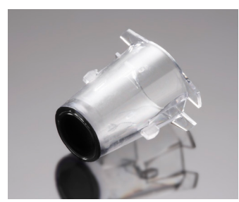
Corning FluoroBlok 6.5 mm insert