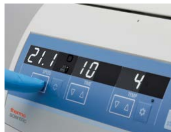
Large, bright and easy-to-read display