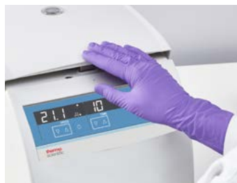
Fast one-click centrifuge lid closure