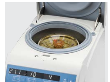
Up to 21,100 x g